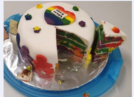
Rainbow bake sale at Scariff Community College, Clare.