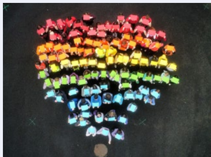
Rainbow Jumper Day at St Oliver Post Primary, Meath.