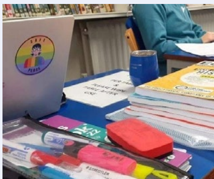
'Safe place' rainbow stickers for LGBTQ+ student allies at Coláiste Choilm, Cork.