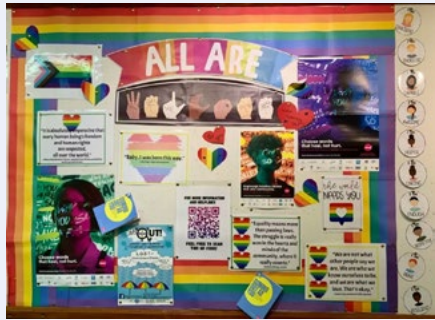
LGBTQ+ noticeboard with QR code for information and helplines at Mount St. Michael, Cork.

Draw inspiration for activity ideas from previous Stand Up Awareness Week participants!