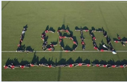
Students spelling out the LGBTQ+ acronym at St. David's CBS, Dublin.