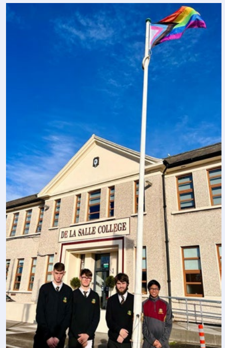
Students raising the Pride flag at De La Salle College, Louth.