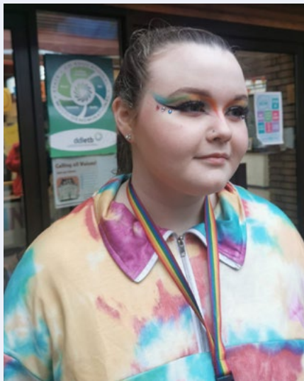
LGBTQ+-themed make up and non-uniform day at Deansrath Community College, Dublin.